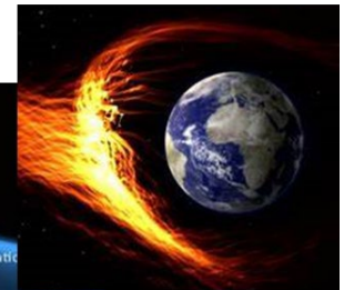
HEMP and GMD event examples